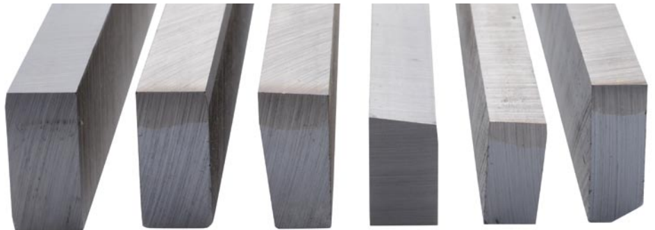
Cage Bars profiles