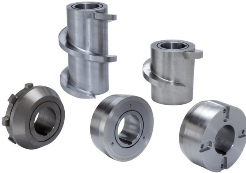
Screw Press Wear Parts